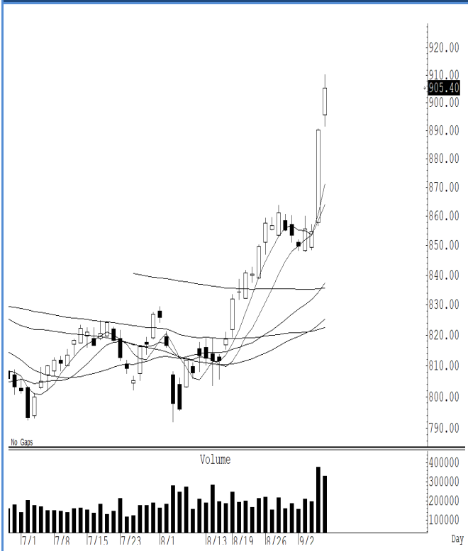
S50U24 (Close 905.40 Chg 15.10)